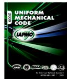
2009 Uniform Mechanical Code (Soft Cover) $103.00

Non-Members, Guests Invited Meeting Thursday April 22, 2010