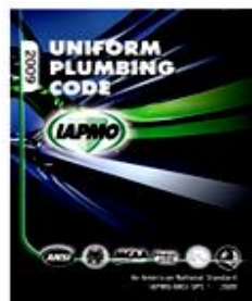
2009 Uniform Plumbing Code (Loose Leaf) $126.00

Code books are available at the IAPMO online book store at http://www.iapmostore.org